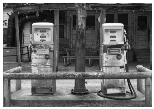
Shelby Store, Photo by Madison Luetge